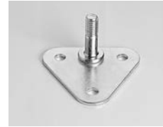
Modified Foot Plate MFP1C