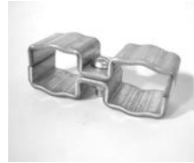
Post Clamps PC2