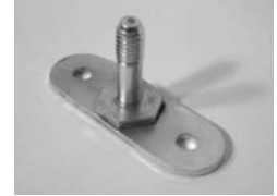
Half Modified Foot Plate MMP1C