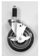
Swivel Caster with brake